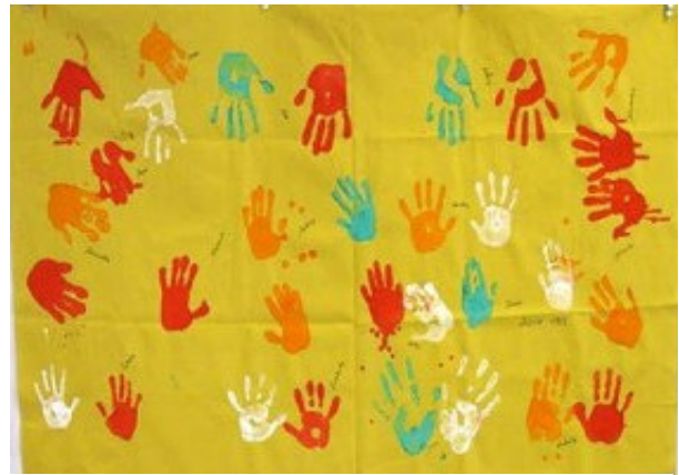
Narrowed by squeezing

The necessary software is part of some releases of Photoshop. Free versions are also available. The one I prefer is Arachne < http://tinyurl.com/27ye5an >—in large part because it’s the only one I’ve figured out how to use.