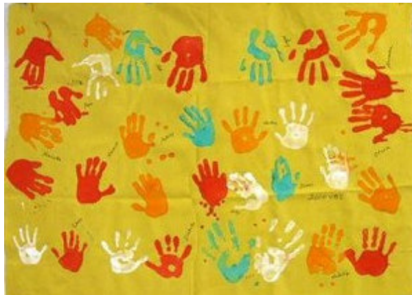
Narrowed using Seam Carving