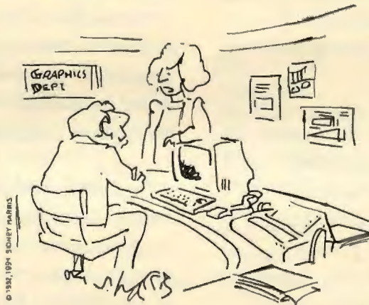
"Of course they always tell you to make changes -- that's because you always tell them how easy it is to make changes."

digital art galley, currently exhibiting the work of fourteen local artists. It is the only gallery of its kind on the Peninsula. We also offer free seminars on a number of computer topics, including "Design for the World Wide Web," new 3d software for drawing the human figure (Fractal Design Poser), and MacroMedia's director, to make exciting multimedia presentations. Call (415) 328-5048 to be on our mailing list for announcements about these seminars, as well as updates to the class schedule.